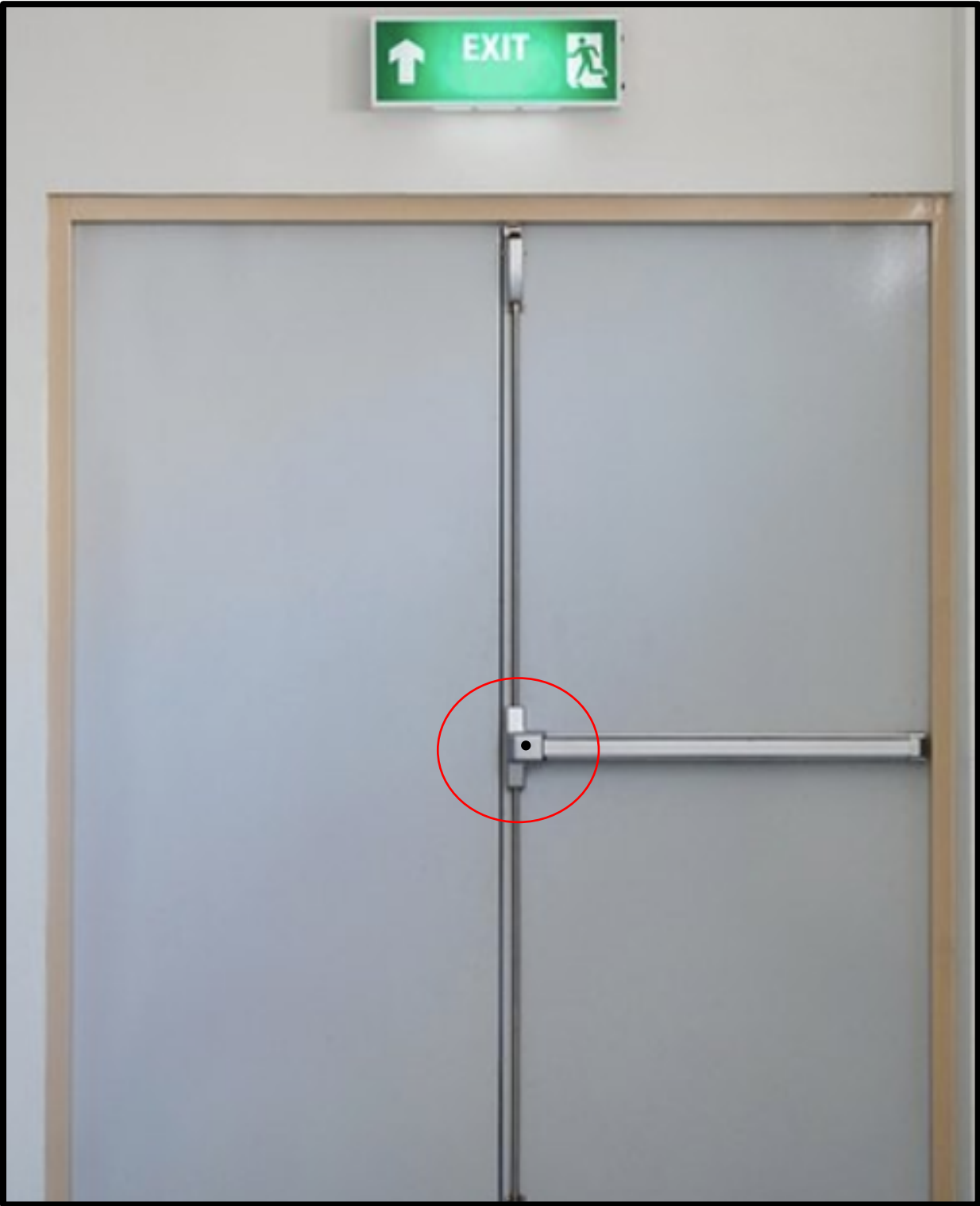
Exhibit #10: Picture - Double Doors with Push Bar

Note: The red circle is circled around the pass key hole where guitar string was found.