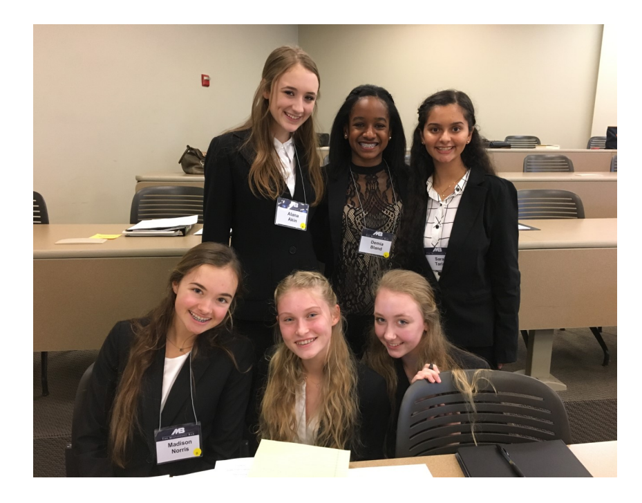
Lamar School Team 2