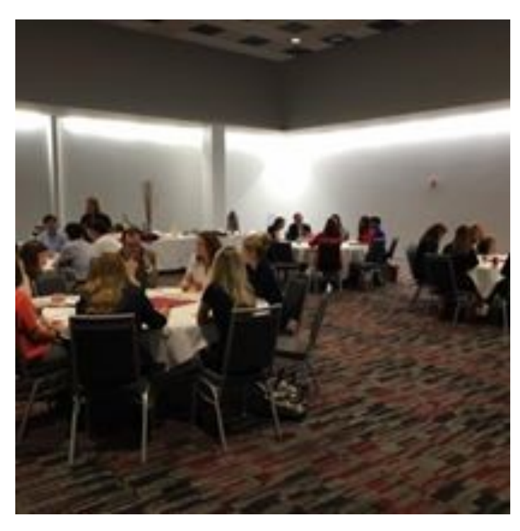
Group Discussion at the Annual Retreat for the YLD

The practice of law has been kind to us, but, this journey has not been without its embarrassing moments. We have opened an estate or showed up for a hearing in the wrong county or at the wrong courthouse, we have ripped our pants while talking to a jury, we have had depositions that have gone off the rails, we've called judges "Your Excellency," and have each had numerous moments where we are reminded that the practice of law really is a practice. We look forward to working together to serve you as members of the Young Lawyers Division. We live all across your state—chances are we are in your city or town. Look us up. At a minimum, we can likely recommend a bottle of wine!