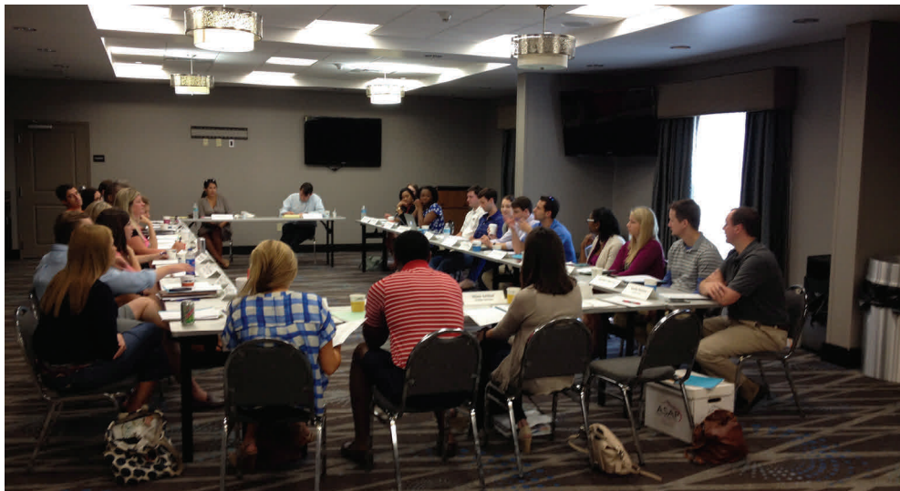
A Photo of the YLD Board Members hard at work at the Fall 2015 board meeting in Oxford Mississippi.