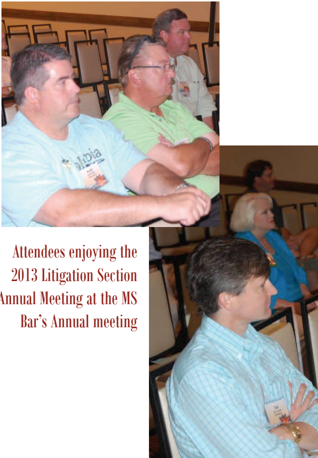
Attendees enjoying the 2013 Litigation Section Annual Meeting at the MS Bar’s Annual meeting